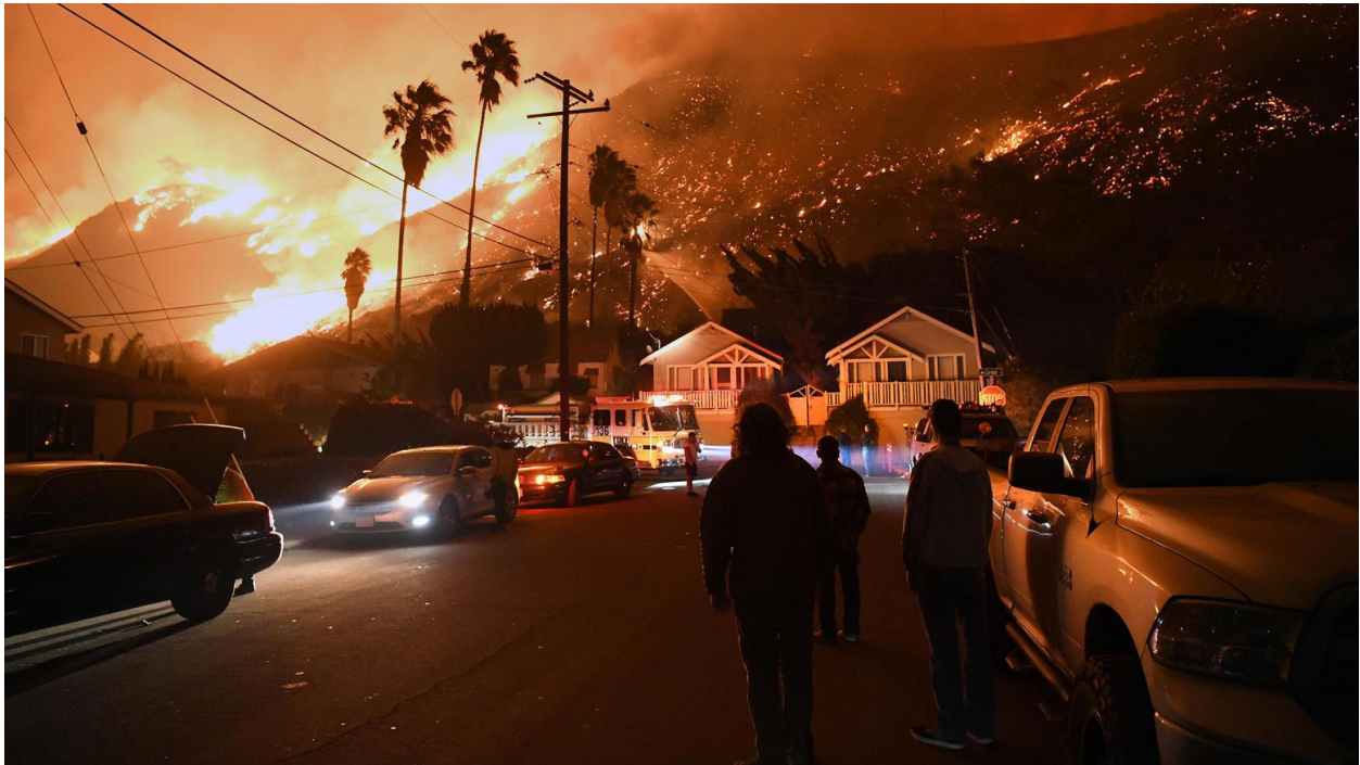
Residents watch the Thomas fire on Prospect Street in Ventura.